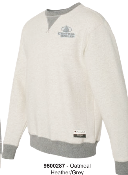
9500287 - Oatmeal Heather/Grey