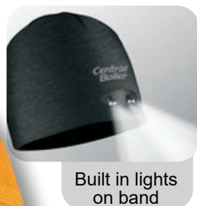
Built in lights on band