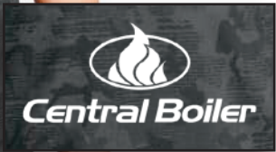
Screen printed on left sleeve

This 4 oz. tee is 100% poly with stay-cool wicking technology built in. This t-shirt is sublimated with tonal camo print, has raglan sleeves with flatlock stitching, OGIO® heat transfer label for tag-free comfort and has a reflective "O" heat transferred on the left hem. Central Boiler graphic screen printed on left sleeve.