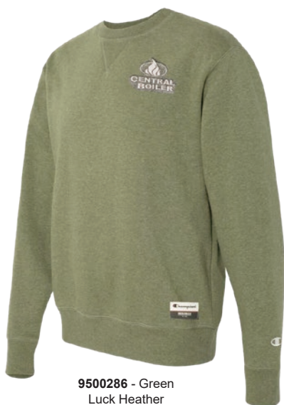
9500286 - Green Luck Heather