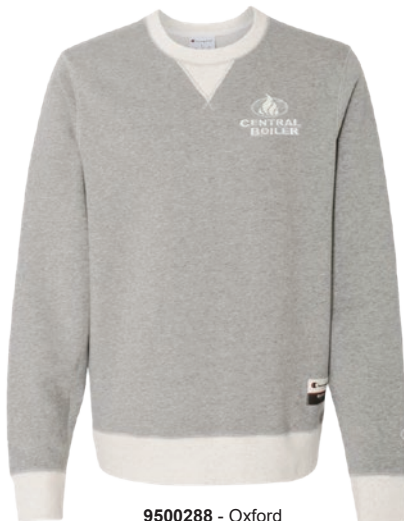
9500288 - Oxford Grey/Oatmeal