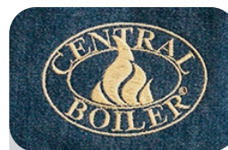
Logo on shirt