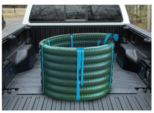
25 mm ThermoPEX is easier to transport