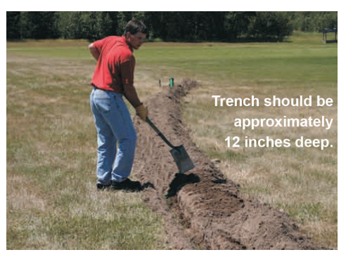
ThermoPEX only needs a narrow trench for installation

ENERGY EFFICIENT: ThermoPEX saves energy and maximizes efficiency. The corrugated waterproof jacket keeps moisture out and inner construction locks the heat in. Greater system efficiency maximizes the delivery of heat from each pound of wood so you will burn less wood compared to a system using inferior insulated piping.