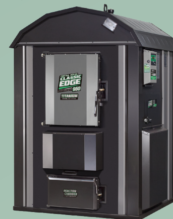
CLASSIC EDGE 960 TITANIUM HDX

Overall Efficiency (LHV) - 92.1%* Overall Efficiency (HHV) - 85.6%* Mfr's Rated Heat Output Capacity - 400,000 Btu/hr Heat Output (12 hr) - 212,957 Btu/hr