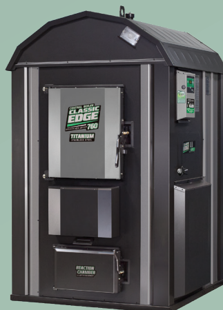
CLASSIC EDGE 760 TITANIUM HDX

Overall Efficiency (LHV) - 84.4%* Overall Efficiency (HHV) - 78.3%* Mfr's Rated Heat Output Capacity - 245,000 Btu/hr Heat Output (12 hr) - 146,686 Btu/hr