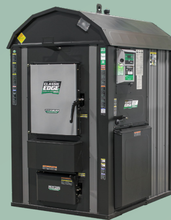
CLASSIC EDGE 865 TITANIUM HDX

Overall Efficiency (LHV) - 92.7%* Overall Efficiency (HHV) - 86.5%* Mfr's Rated Heat Output Capacity - 245,000 Btu/hr Heat Output (12 hr) - 156,000 Btu/hr