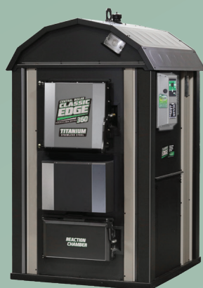
CLASSIC EDGE 360 TITANIUM HDX

See back page for financing details and other important information.