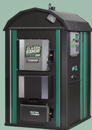
CLASSIC EDGE 560 TITANIUM HDX

Overall Efficiency (LHV) - 86.4%* Overall Efficiency (HHV) - 80.6%* Mfr's Rated Heat Output Capacity - 190,000 Btu/hr Heat Output (12 hr) - 92,000 Btu/hr