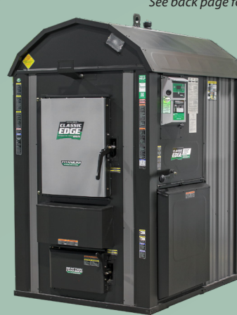
CLASSIC EDGE 865 TITANIUM HDX

Overall Efficiency (LHV) - 92.7%* Overall Efficiency (HHV) - 86.5%* Mfr's Rated Heat Output Capacity - 245,000 Btu/hr Heat Output (12 hr) - 156,000 Btu/hr