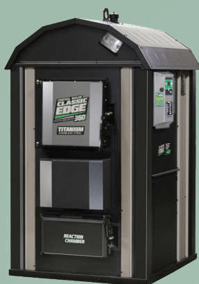
CLASSIC EDGE 360 TITANIUM HDX

See back page for financing details and other important information.