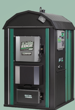
CLASSIC EDGE 560 TITANIUM HDX

Overall Efficiency (LHV) - 86.4%* Overall Efficiency (HHV) - 80.6%* Mfr's Rated Heat Output Capacity - 190,000 Btu/hr Heat Output (12 hr) - 92,000 Btu/hr