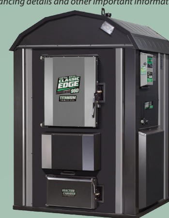
CLASSIC EDGE 960 TITANIUM HDX

Overall Efficiency (LHV) - 92.1%* Overall Efficiency (HHV) - 85.6%* Mfr's Rated Heat Output Capacity - 400,000 Btu/hr Heat Output (12 hr) - 212,957 Btu/hr