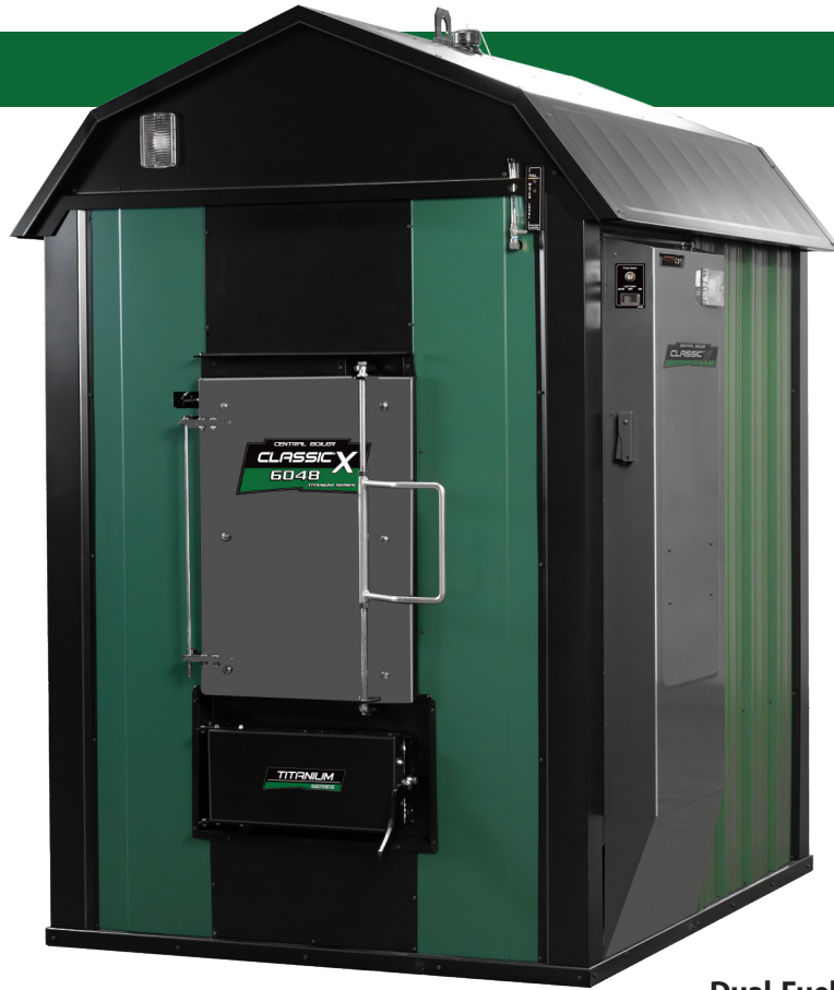
Dual-Fuel Ready Outdoor Wood Furnace