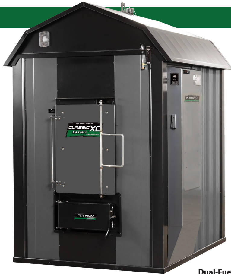
Dual-Fuel Ready Outdoor Coal Furnace